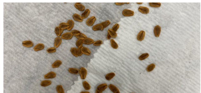
Fig. 5. Sprinkle seeds across paper towel.

Step 2: Fold the paper towel once (or twice if large). Sprinkle some seeds across paper towel. Fold the paper towel over the seed so that the seeds are fully wrapped in the paper towel (Fig. 5).