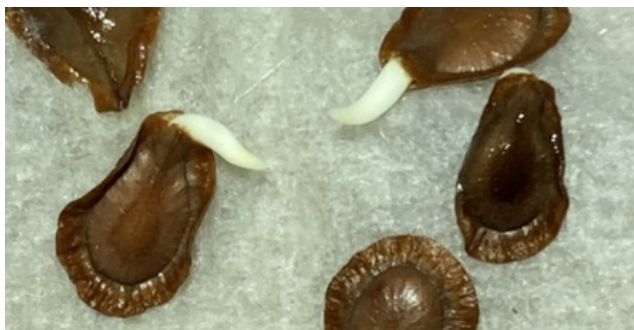
Fig. 7. Milkweed seeds germinating.

Step 4: After 30 days, remove from refrigerator. Do not be alarmed if you see some mold on the paper. This is normal and the seeds should be fine. Check the seeds by gently squeezing: if the seed is squishy, it is dead and should be discarded. If the seed still feels firm then it is fine. Transfer the seeds to a fresh damp paper towel and fold them in like before and place back in the plastic bag. Place the plastic bag in a warm place. Avoid placing in direct sun as this could kill seeds. Check the seeds daily by gently unfolding the paper towel to look for signs of germination. If germinating, a tiny white root will emerge from the end of the seed (Fig. 7). It is important to catch germination as early as possible since the roots are easily damaged as they get longer. Ideally the seeds are easiest to work with if the root length is less than a ¼ of an inch. If you are unable or don't want to check the seeds daily, you can transfer any seeds that still feel firm to starter pots now.