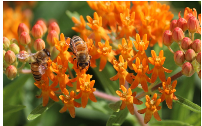
Fig. 14. Butterfly milkweed ( Asclepias tuberosa) with honey bees ( Apis mellifera).

The information given herein is for educational purposes only. Reference to commercial products or trade names is made with the understanding that no discrimination is intended and no endorsement by the Cooperative Extension Service is implied.