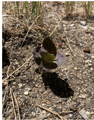
Figures 12 and 13. Transplanted milkweed.