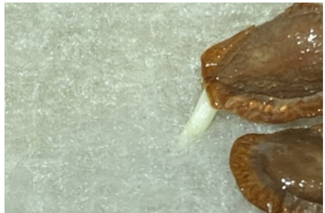
Fig. 8. Milkweed seed germinating with root tip growing into towel.

Step 5: After the first evidence of germination, it is time to plant the seeds. Be extremely careful, since new root tips are very fragile and can be easily broken, which kills the seed. As seeds continue to germinate, the root will grow bigger and longer making it more susceptible to damage when transplanting. For this reason, it is better to not wait too long after first noticing germination to plant the seeds. The roots can also grow into the paper towels if left too long, making it difficult to remove without damaging the seed (Fig. 8).