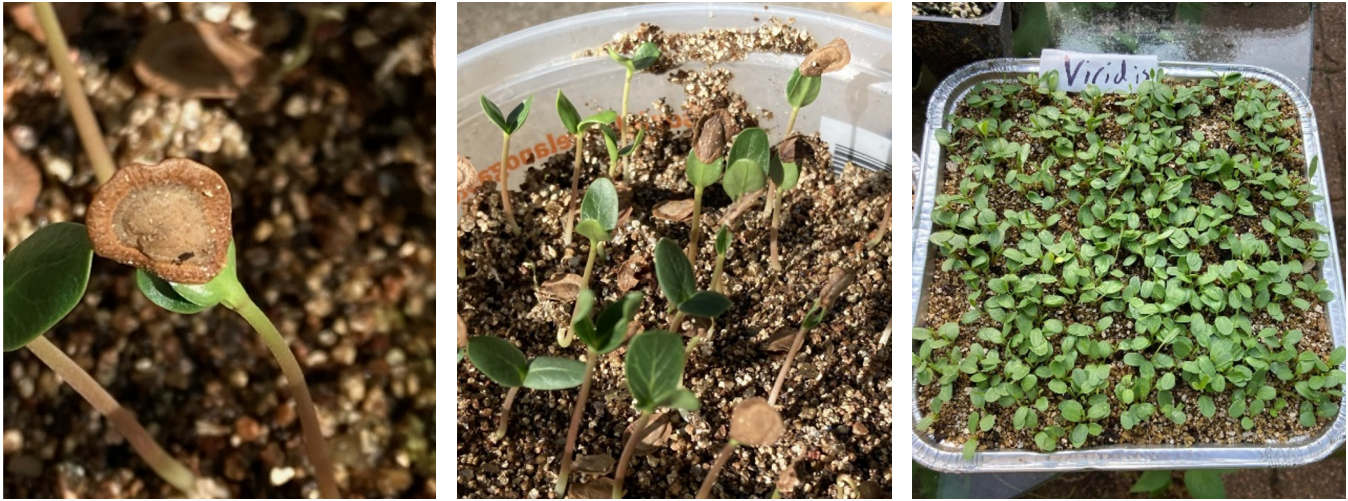
Figures 9-11. Milkweed seedlings.

Step 8: Transplant milkweed plants to a garden when the plants are about 4-5 inches in height and have multiple leaves (Fig. 12-14 and 14). Milkweeds prefer well-draining soils and can tolerate extra water while getting established, but not as much water as many store-bought plants. Remember over-watering kills more plants than under watering! Also, keep in