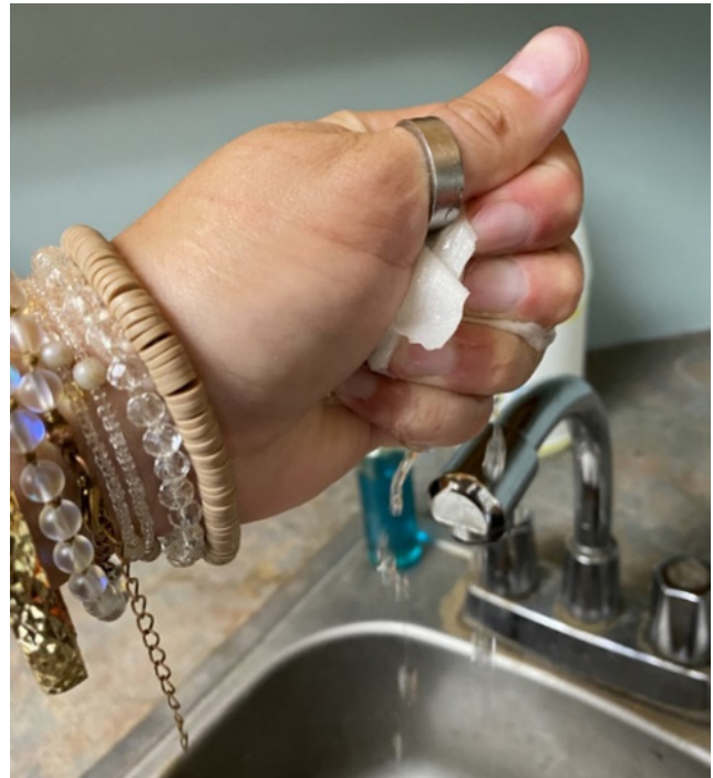
Fig. 4. Squeeze out as much excess moisture as possible out of a paper towel to prevent mold.