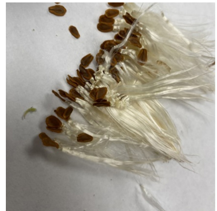
Figures 1, 2 and 3. Common milkweed ( Asclepias syriaca ) seed pod slightly dehiscent (Left). Squeeze the seed pod to open the pod further to look inside (Middle). The seeds are brown and viable and can be removed from the pod (Right).